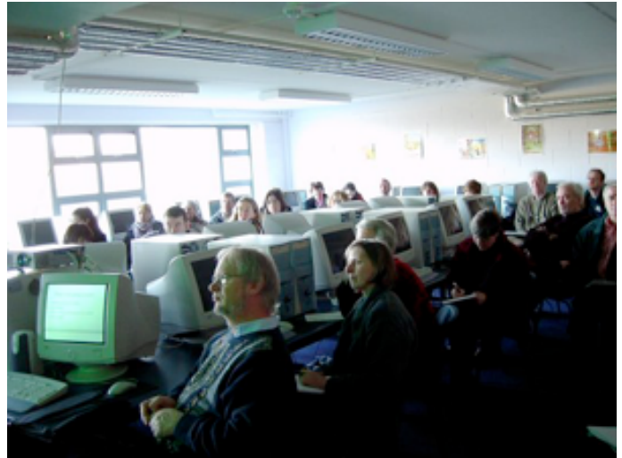
Participants in the Network workshop

of the Labour Party, who emphasized his concern for the future wellbeing of the Education System and the necessity to have firm support for mathematical, science and technology education.